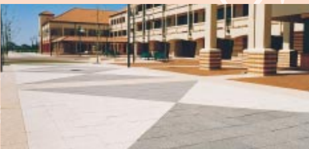
Rockingham City Council, Perth.