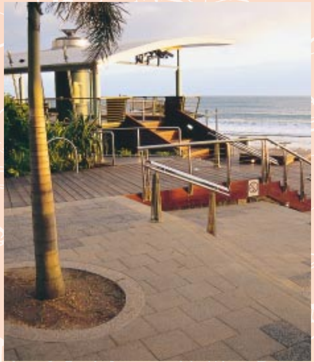
Mooloolaba Esplanade, Sunshine Coast.