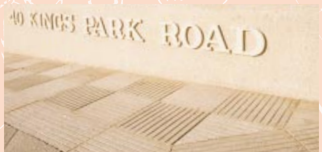
40 Kings Park Road, Perth - distinctive paving modules.