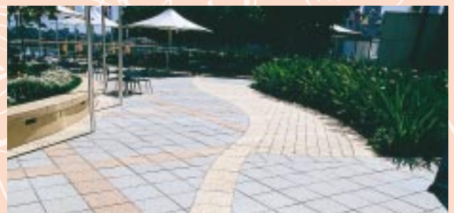
Star City Casino, Sydney - flexibility at its best.