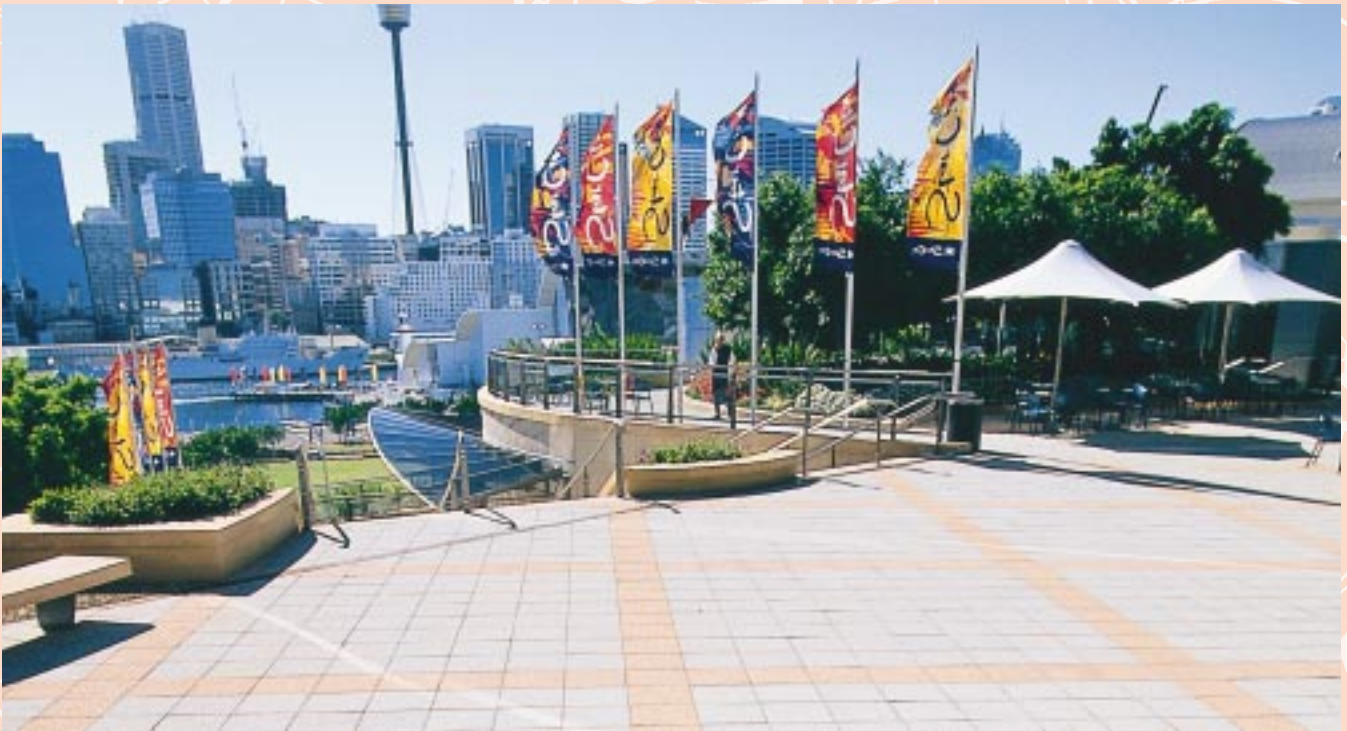
Magnificent Star City Casino, Sydney.