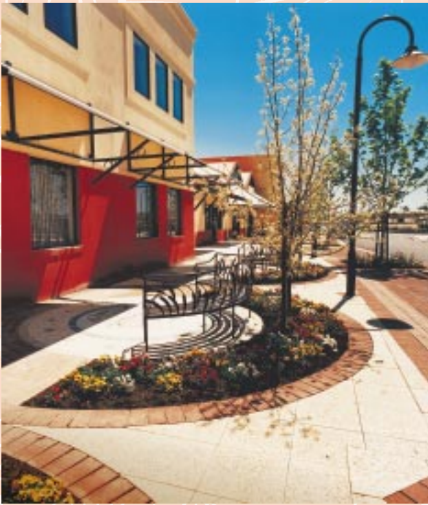
Stylish Ellenbrook Estate, Perth.