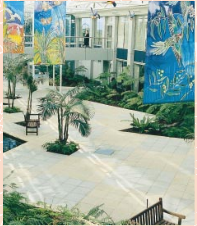
Knox City Council offices, Melbourne.

UrbanStone's flexibility allows designers to consider current community needs and demands as well as those of our environment. The virtually unlimited range of colours and textures is available in all product sizes.