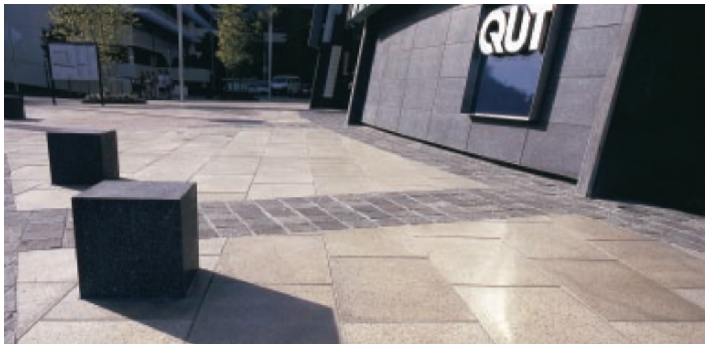
QUT Gardens Point Campus, Queensland

Toowoomba City Council Streetscape Upgrade Griffith University