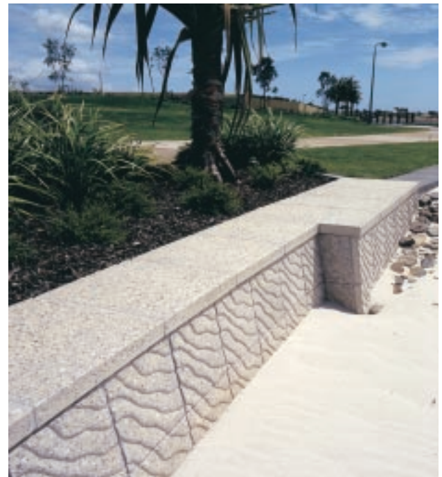
Kawana Island Estate, Queensland

This strategic plan continues to position UrbanStone as the market leader in an increasingly aggressive and competitive market, the result of which has led to strong specification work and continued public demand around the nation.