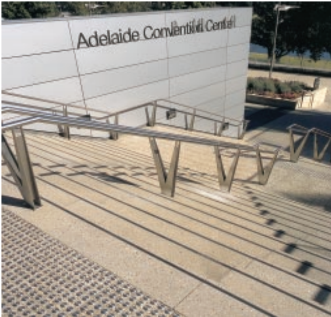
Adelaide Convention Centre

Larger format sizing and the ability to manufacture, package and deliver combinations of these mixed size combinations will bring yet another design element into the already exciting world of UrbanStone Pavescapes for residential use.