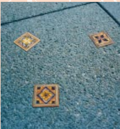
Moorabbin, Victoria - utilising community art in sidewalk paving.