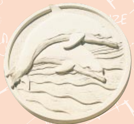
Craftsmanship and design flexibility creates distinctive logos for customising projects.