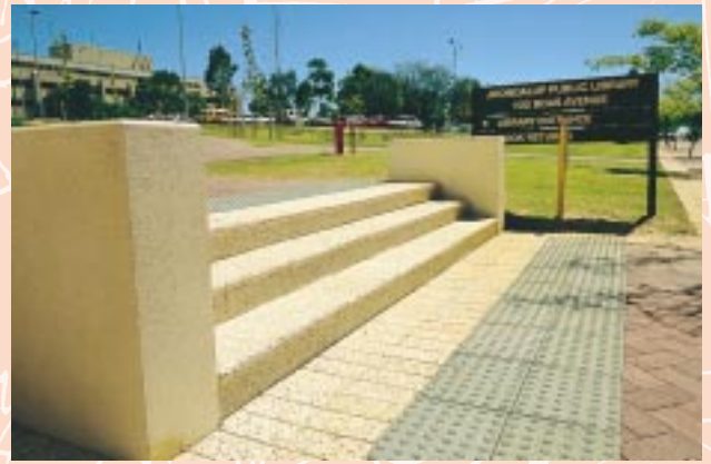
Joondalup City Public Library - exposed aggregate pavers and tactile hazard warning units.

The desire to achieve the best accessory range continues to keep UrbanStone at the forefront of flexibility in concrete accessory design.