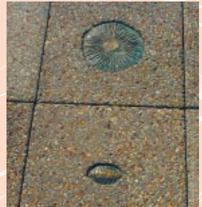
Mooloolaba, Sunshine Coast - custom-made paving art.