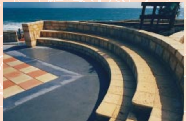
North Cottesloe Beach, Perth - bullnose seating.