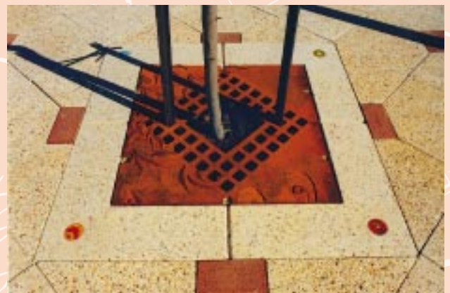
Joondalup City, Perth - uniquely designed tree surrounds.