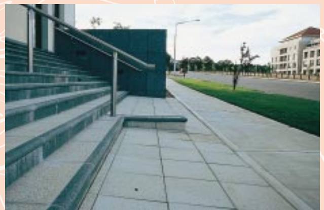
Canberra, ACT - dual colour bullnose Stair-treads.