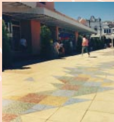
Coburg Mall, Melbourne - paving as art.