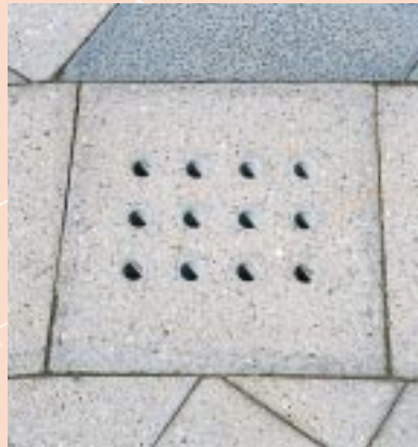
Star City Casino, Sydney - specially designed drainage pavers.