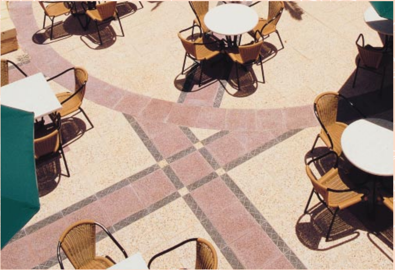
Joondalup Resort, Perth - exquisite designs and extensive use of polished Quadra Border accessories.