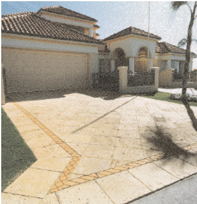
6. The magnificent end result - Your new driveway paving.

5. The Preliminary Paving Plan gives you a glimpse of how UrbanStone paving, borders, bullnoses and cladding will transform your home before you place your order.