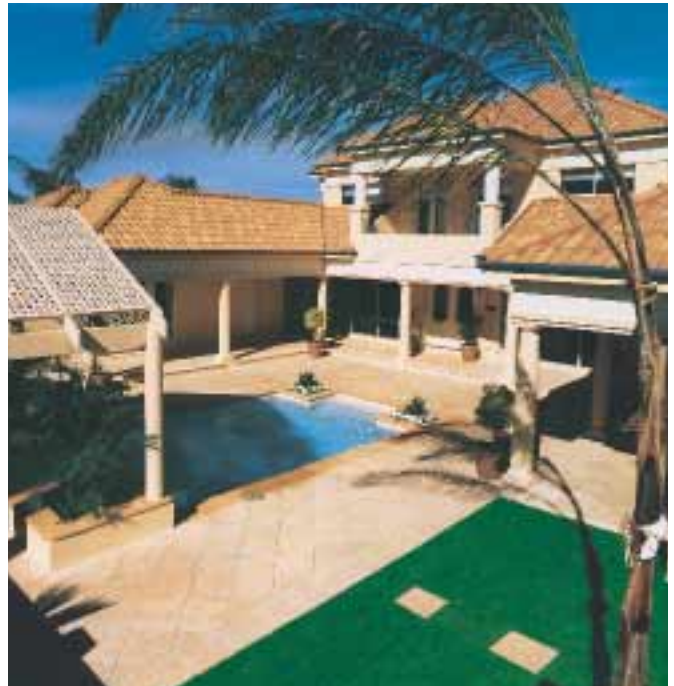
7. Exceptional UrbanStone paved entertainment area.